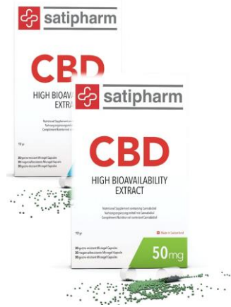
Gelpell® Microgel Capsules