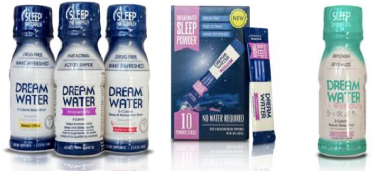
Dream Water Liquid Sleep Shots